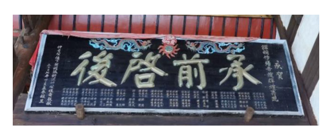
Figure 7: Couplet in the ancestral hall of Tan's family