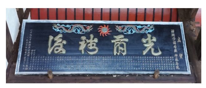
Figure 8: Plaques in the ancestral hall of Tan's family