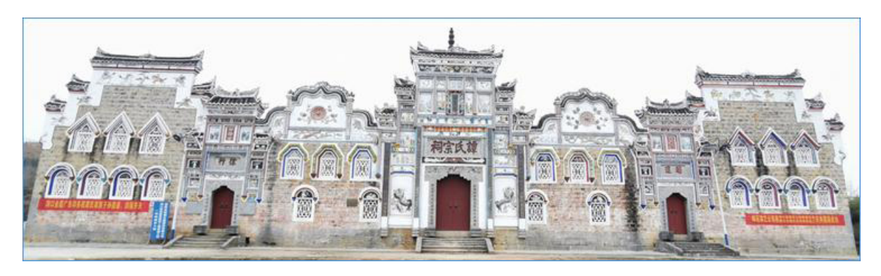
Figure 1: Archway, Ancestral Hall of Tan's family